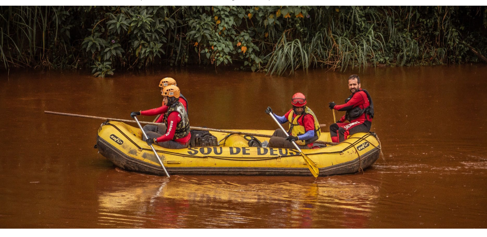
Contamination of the Paraopeba River after the 2019 tailings dam collapse near Brumadinho, Brazil.

Tailings facilities must not be constructed where there are facilities that present considerable evacuation challenges in the zone of influence, including, but not limited to, jails or prisons, hospitals, and assisted-living or elder care facilities (See Guideline 3). Even if operating companies carry out training and emergency drills, certain social groups (the elderly, small children, people with disabilities, etc.) require special assistance. Based on the goal of zero harm to people, companies must ensure that trained professional support will be provided during an emergency and will reach all affected populations in a timely manner.