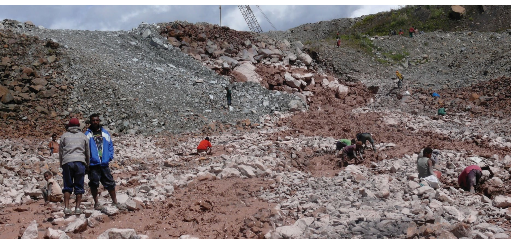
Community members standing on a mine waste pile at the Porgera mine in Papua New Guinea.

The full scope of indemnification, remediation, and reclamation criteria must be determined through a participatory process subject to the approval of affected communities, agricultural producers, and businesses, and made publicly available. Discussions with affected communities to establish identification criteria must begin before construction of a tailings disposal facility, undergo periodic updates, and continue in the event of a failure. Affected communities must have access to independent technical assistance at every stage of this process (see Guideline 16).