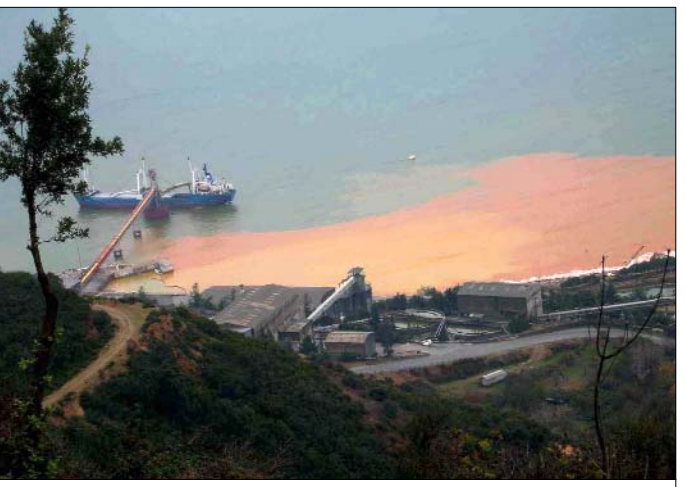
Spill at TVX's Stratoni mine in Greece, December, 2002.