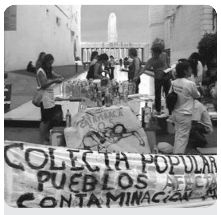
Activists and schoolchildren in Rosario organized a popular collection of drinking water to send to children and schools in Andalgalá. December 2007

There are a host of well documented environmental issues arising from the Alumbrera mine, including spills from the slurry pipeline, a transport accident where 21,000 kg of ammonium nitrate destined for the mine was released, clouds of exploded powder at the mine site, and potential releases of ar-