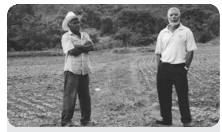
A local farmer discusses the shortage of water for farming in the area surrounding the mine.