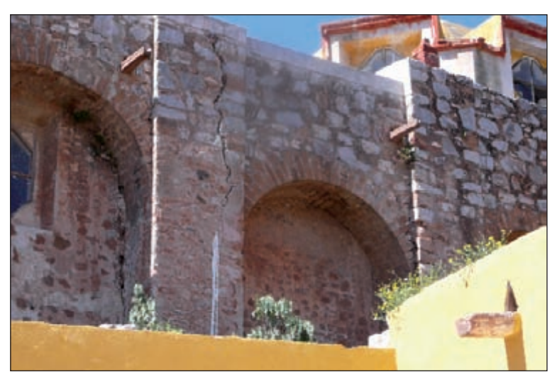
Evidence of damage already inflicted on a centuries old church, due to vibrations from explosions.

MSX also claims to have the best interests of the local population, environment and economy in mind, stating "Minera San Xavier represents a superb opportunity to raise the quality of life of the residents (...) of Cerro San Pedro'<sup>3</sup>